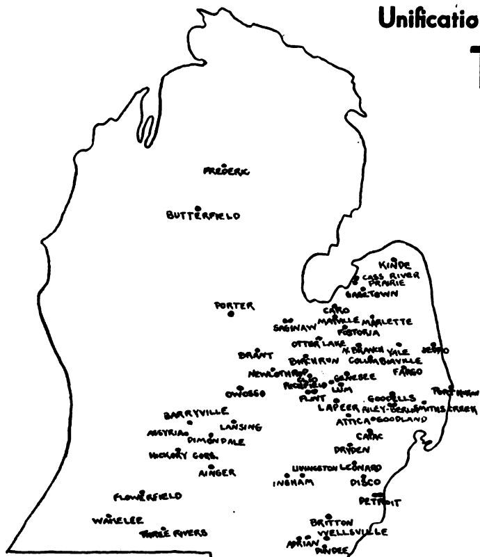
FORMER METHODIST PROTESTANT CHARGES NOW IN THE NEW METHODIST CHURCH

E IGHTY-THREE years ago in the city of Adrian the first session of the Detroit Methodist Episcopal Conference took place and now in the year 1939 the first session of the new Methodist Church convenes at this historic place. Adrian bears the distinction of being the home of Adrian College. Sixty-five years ago the Michigan Christian Advocate got its start in the same town and it is also the birthplace of what later came to be known as the Northwestern Advocate.