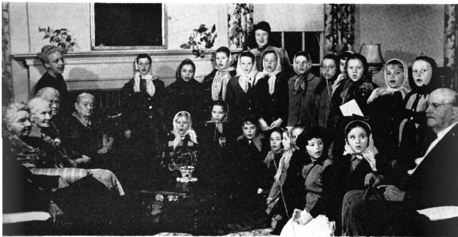
SOME MEMBERS OF THE HOME LISTENING TO THE BROWNIE SCOUT PROGRAM.