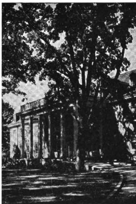
Susanna Wesley Hall, Home of numerous Methodist Summer Conferences

Fully approved by North Central Association Association of American Universities Phi Beta Kappa Mortar Board